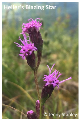
Heller's Blazing Star