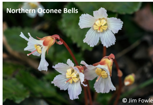
Northern Oconee Bells